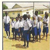
Schoolchildren in Kankobe

To promote the welfare of abandoned orphaned and neglected children of all races and creed, and to establish institutions and homes that care and protect those children in accordance with the UN declaration of children's rights.